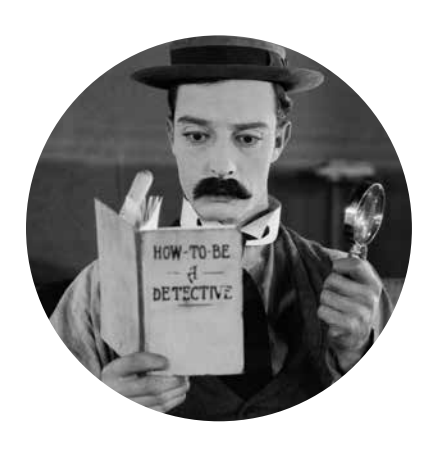
Saturday, August 20, 5:00 pm

Not-So-Silent Cinema (See page 9 for details)