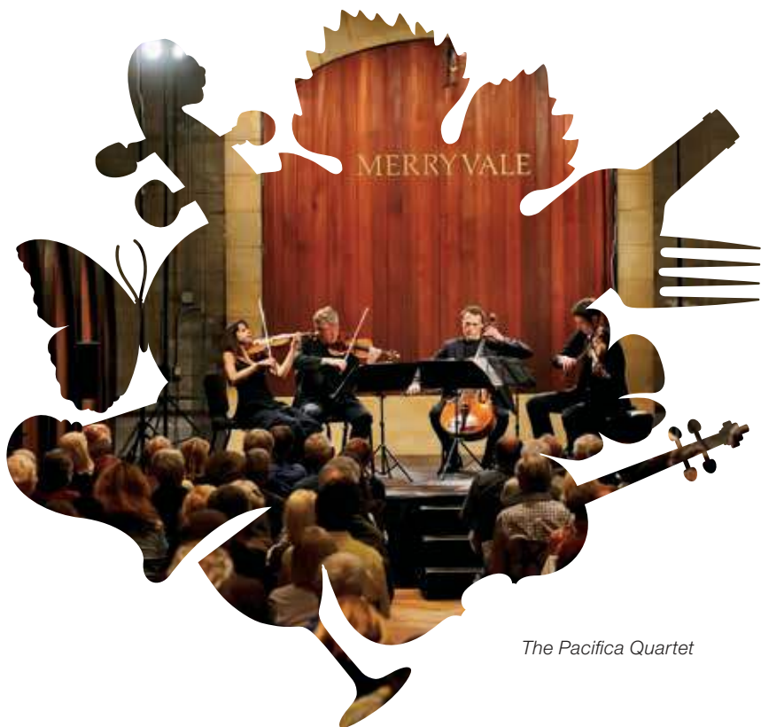
The Pacifica Quartet