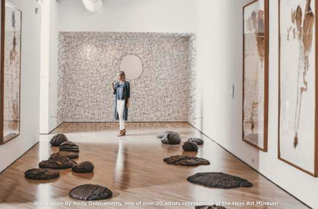
Installation by Andy Goldsworthy, one of over 20 artists represented at the Hess Art Museum